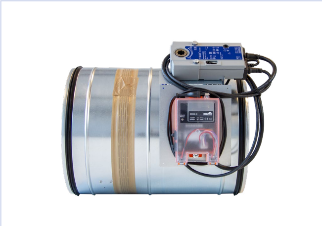
Fig.3, Fire damper with ZX04/ZX05- Belimo BKN/MOD attached