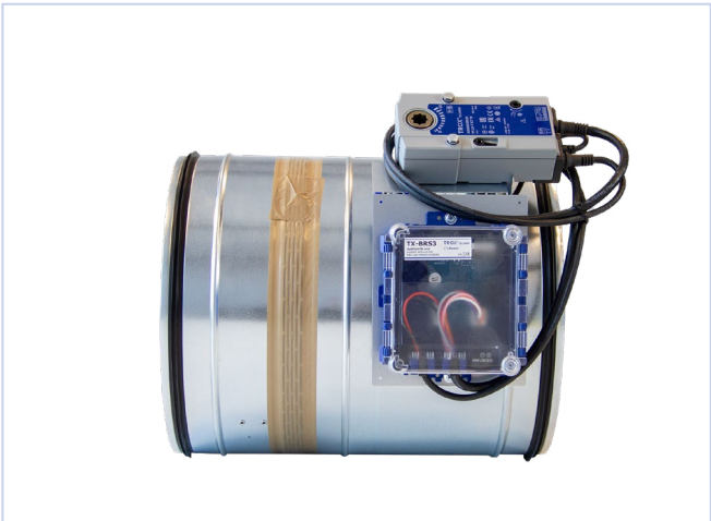
Fig.2, Fire damper with ZX03- Aurasafe-mini attached