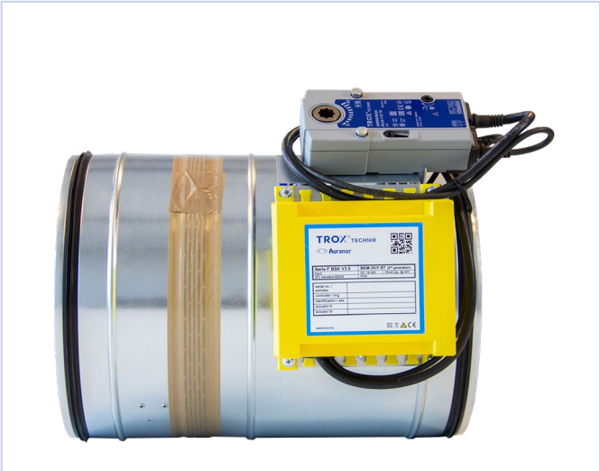
Fig.1, Fire damper with ZX01/ZX02- Aurasafe attached

Examples of FKRS/FKR with attached damper modules can be seen below: